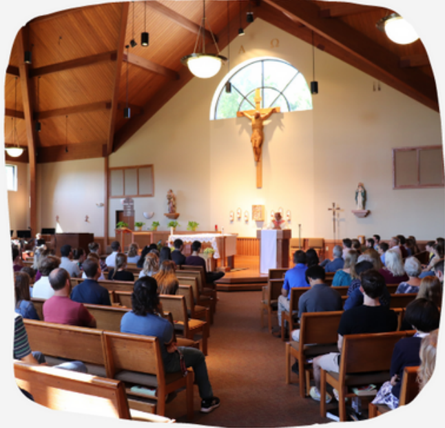
Family Weekend Mass