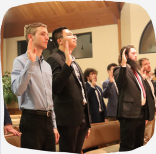
Knights of Columbus