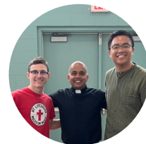
From the Director